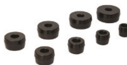
Double Sided Collets (PN 85609499)