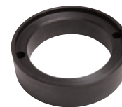
Light Truck Back Cone Spacer (PN 8111935)