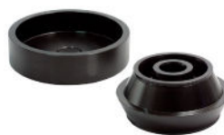
Light Truck Cone Kit (PN 8113277C)