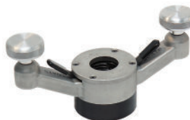
Premium Quick Nut (PN 85607503)