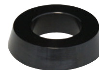
Short Cone (PN 8112421)