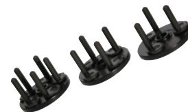
Adjustable Pin Plates (PN 85610104)